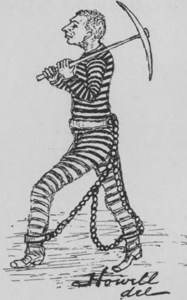
"TOTIN' A CHAIN"