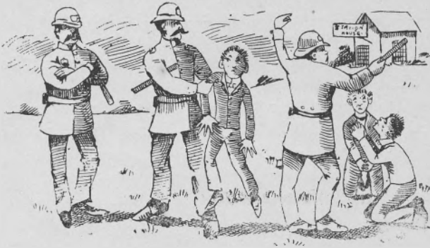
THE COPS AND THE STUDENT.

in the lower grade of the public schools, and requested him to write a short sketch upon the subject. Below we present the result :