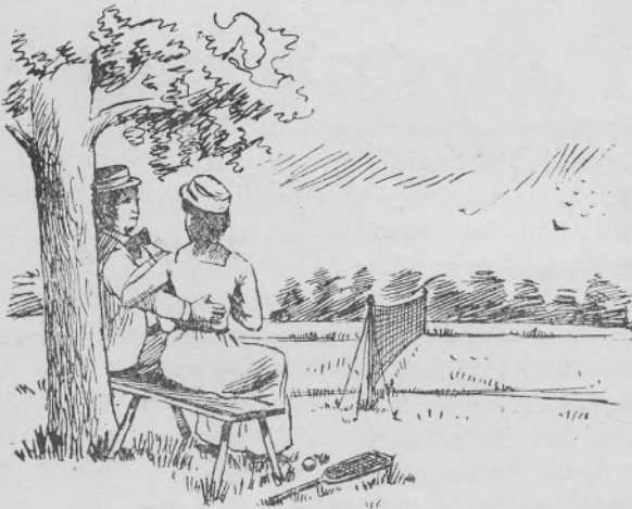
"A Love Game."