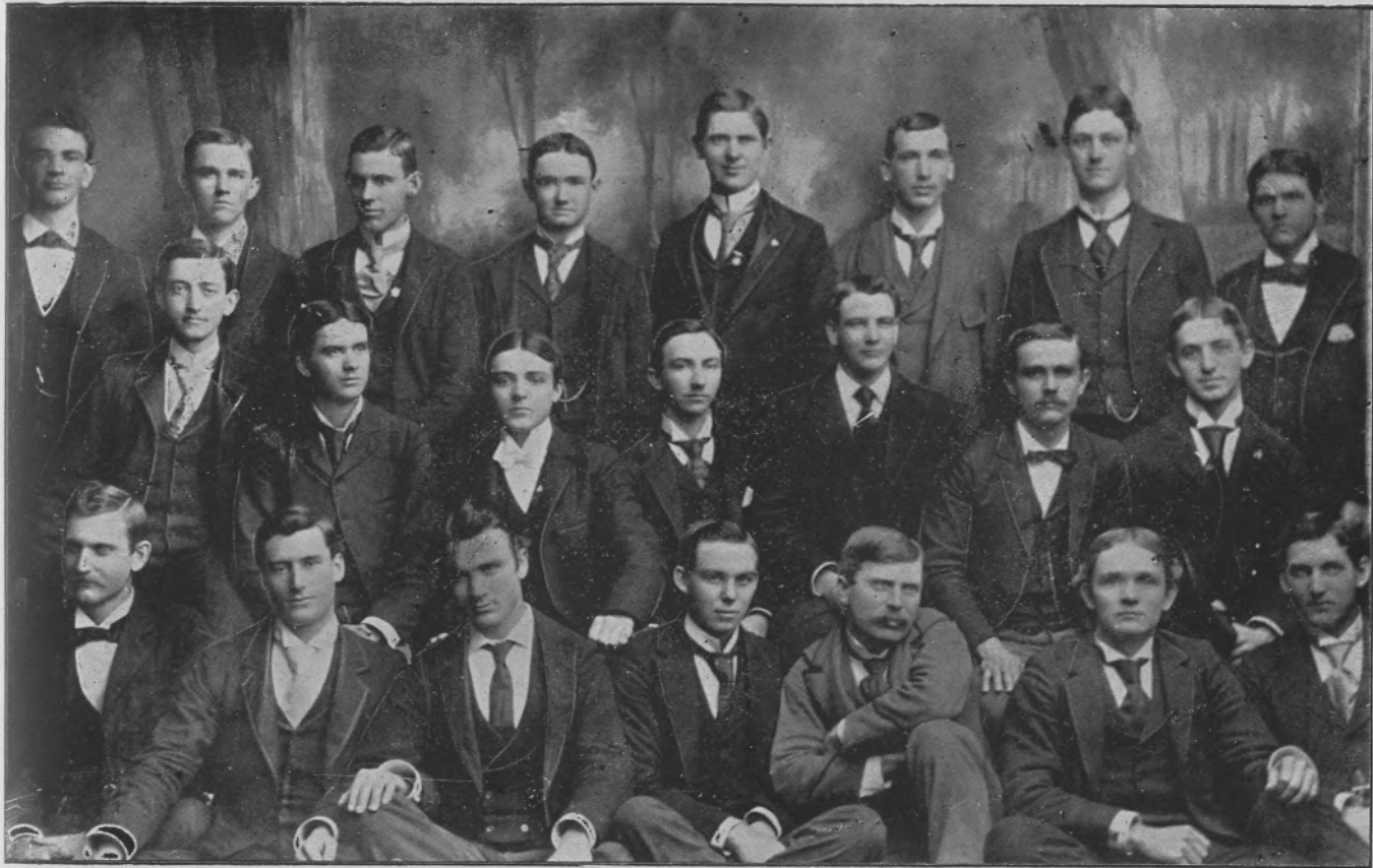
Members of Non-Fraternity Club.