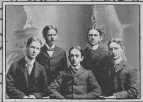
THREE BOARDS OF EDITORS OF RED AND BLACK.